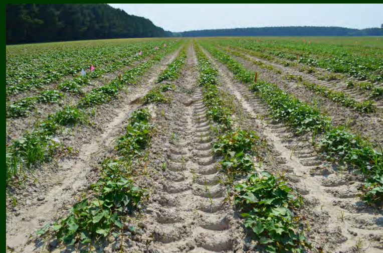
Sandea 0.25 oz + Dual Mag. 0.8 pt + MSO