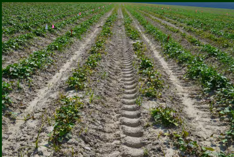
Sandea 0.66 oz/A + MSO